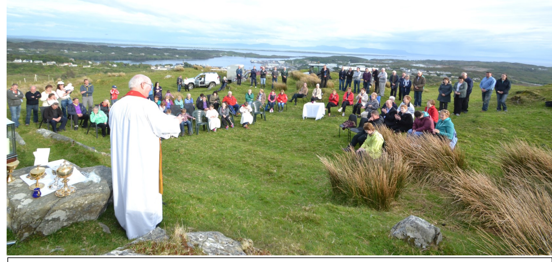
A photo of Mass at Meenahooghan Mass Rock Wednesday 3rd June 2015

Mass at Meenahooghan Mass Rock Wednesday 5th June 7pm