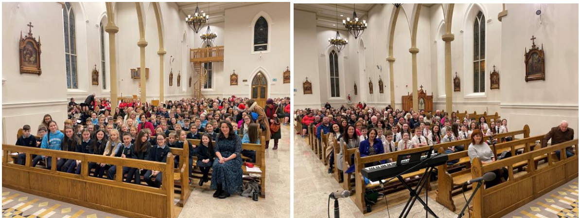
Christmas Carol Service in the Church, Thursday 7 th December 2023

Christmas Gift Suggestions: To your enemy, forgiveness. To an opponent, tolerance. To a friend, your heart. To a customer, service. To all, charity. To every child, a good example. To yourself, respect.