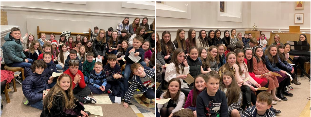
The Junior Choir, Christmas Eve 2022

Live streaming is always available. Go to the parish website killybegsparish.com and click on Services Online .