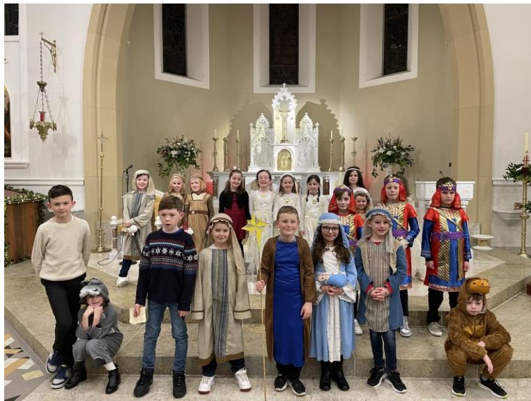
Christmas Eve Mass 2023

Dear St Nicholas, so kind and true, on this special day, we turn to you. With gifts and joy, you fill our hearts, bless us now as this day starts. Guide us with your gentle hand, help us spread love across the land. May we share and care each day, in your spirit, we laugh and play. Thank you, St Nicholas, up above, for your kindness, grace, and love. On this day, and all year through, we celebrate the joy you bring, it's true. Amen.