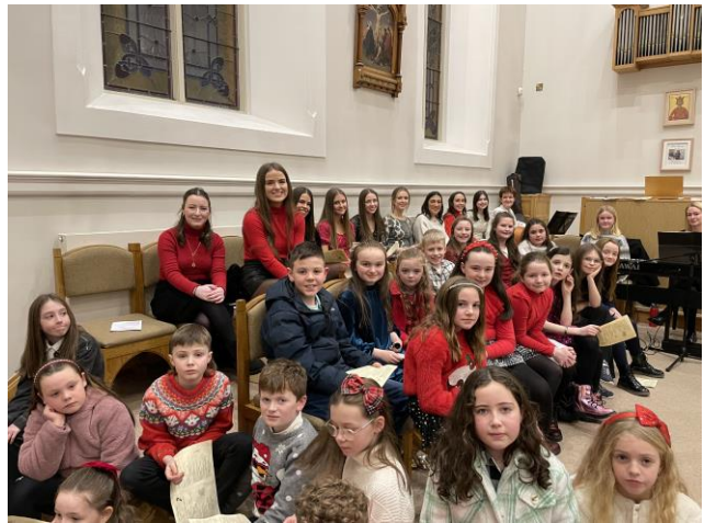
The Junior Choir, Christmas Eve 2023

For unto us a child is born Unto us a Son is given He is Christ the Lord