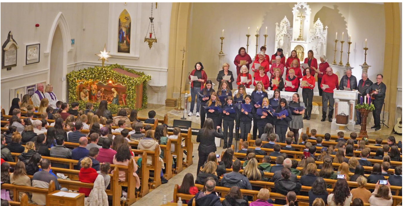
Christmas Carol Service Wednesday 4 th December 2024