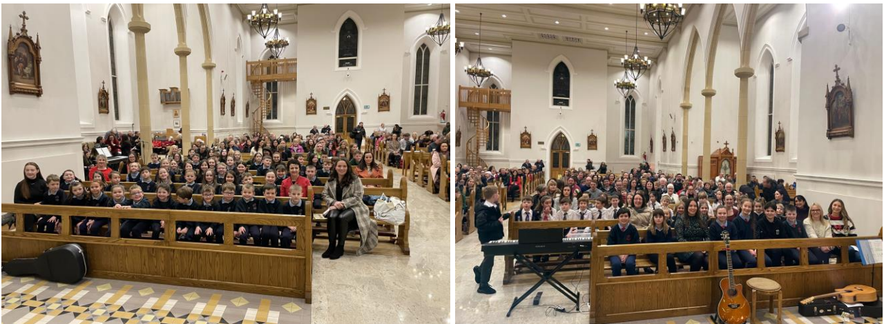
Christmas Carol Service in the Church, Wednesday 4 th December 2024